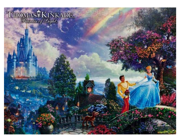
Painter of Lite: This week's second prize, a jigsaw puzzle featuring the "original art" of Thomas Kinkade, and cartoon figures (right).

Week 1088 was the umpteenth installment, give or take an ump, of the contest in which the Invite supplies a list of "answers" in the form of short phrases, and you come up with questions they could answer. One answer was read variously as "14, 102 and 39,000" (i.e., three items) and "14,102 and 39,000" (two items). The Empress accepted either because, like Your Mama, she is just too easy.